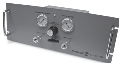
UVC1010, 19 inch wide rack-mount