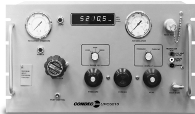
UPC5210 - 19 inch wide rack-mountable version of UPC5200