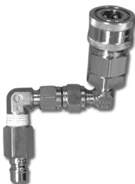
"107288 - NO TOOLS REQUIRED"