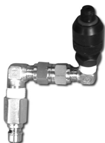
"106594 - NO TOOLS REQUIRED"

Note: Consult factory with your specific Test Port configuration requirements.